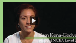
NCEA & the Whanau

in Maori school leavers attaining NCEA level 2 or above from 2009 - 2011