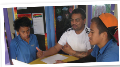
Are you doing something for our community? We could help. Apply for a grant through our website.