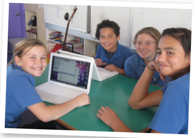
Parklands School Whānau classmates enjoying their new laptops